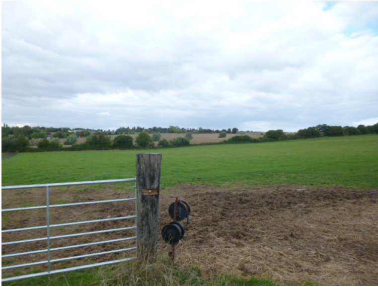
View from Lawshall Road towards north west

What these photographs illustrate is that the generally undulating nature of the landscape to the north of the existing SLA is just as special as the area which has been designated. They provide the justification for the boundary to be extended as shown on our proposals map.