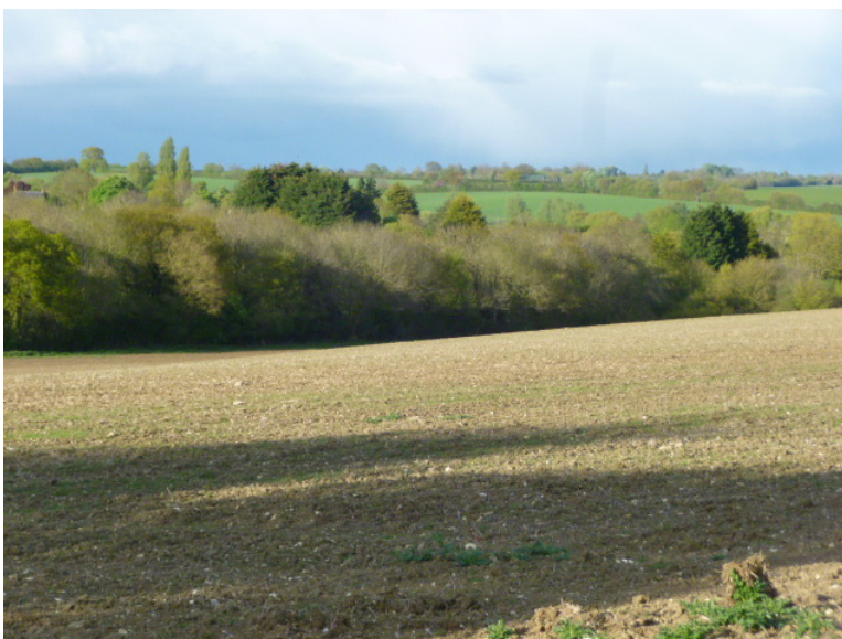
View from Somerton Road towards north