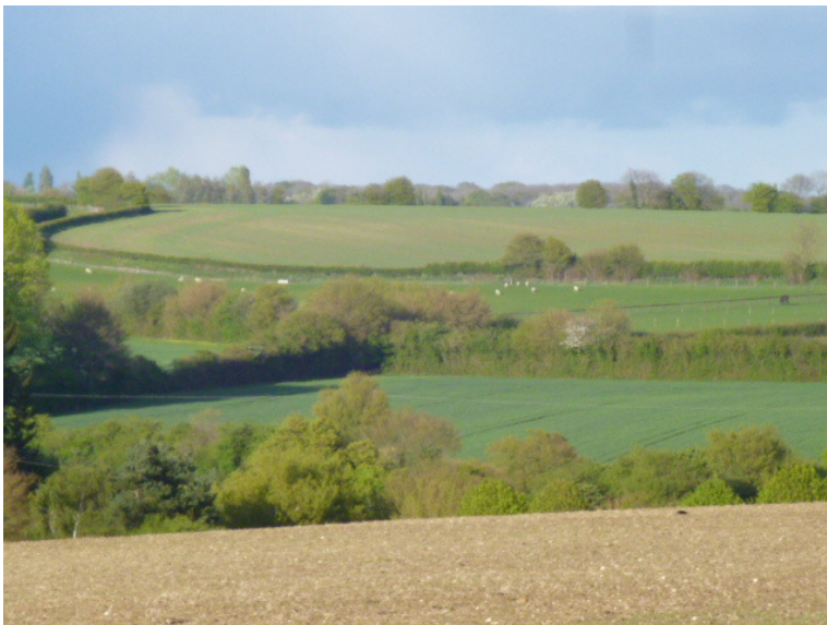
View from Somerton Road towards north east

Photographs taken from key vantage points on roads within the extended SLA, namely the Lawshall Road and the Somerton Road clearly show the undulating character of the landscape which is the result of erosion by watercourses which link either into the present River through the village and on to the Glem or into the Chad Brook, both of which form part of the wider River Stour drainage basin.